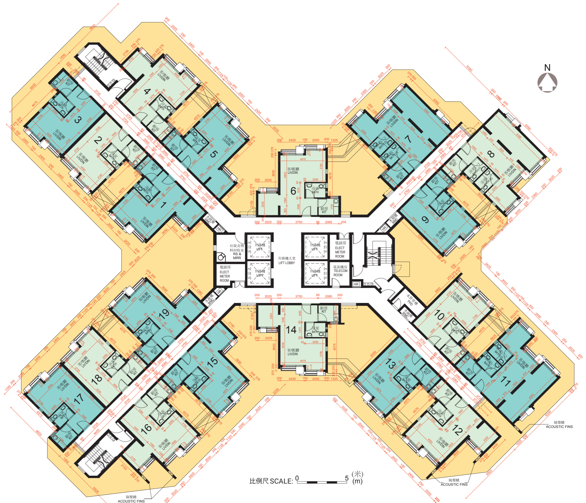
Block A 1/F Floor Plan