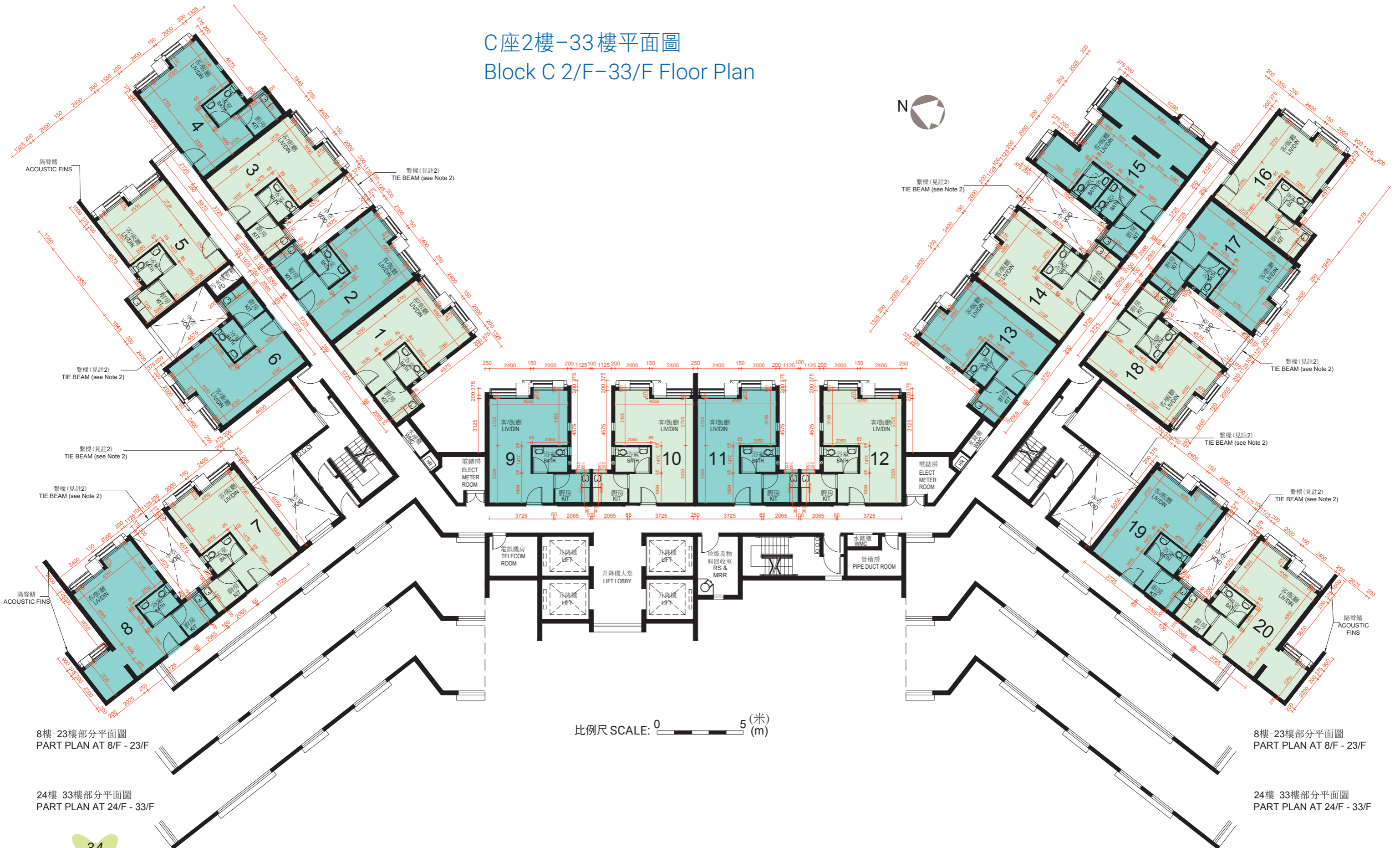
8樓-23樓部分平面圖 PART PLAN AT 8/F - 23/F