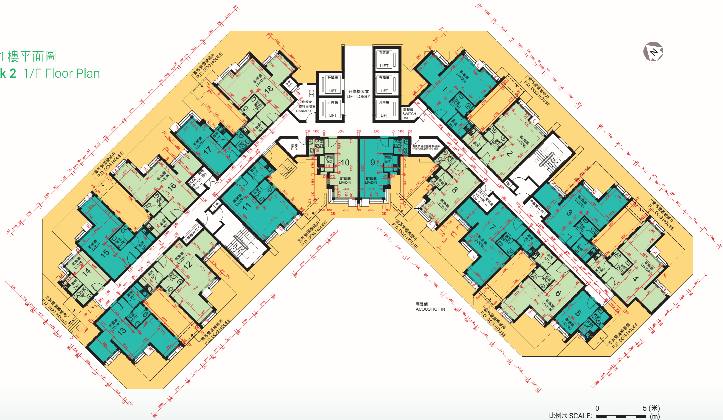
2座1樓平面圖 Block 2 1/F Floor Plan