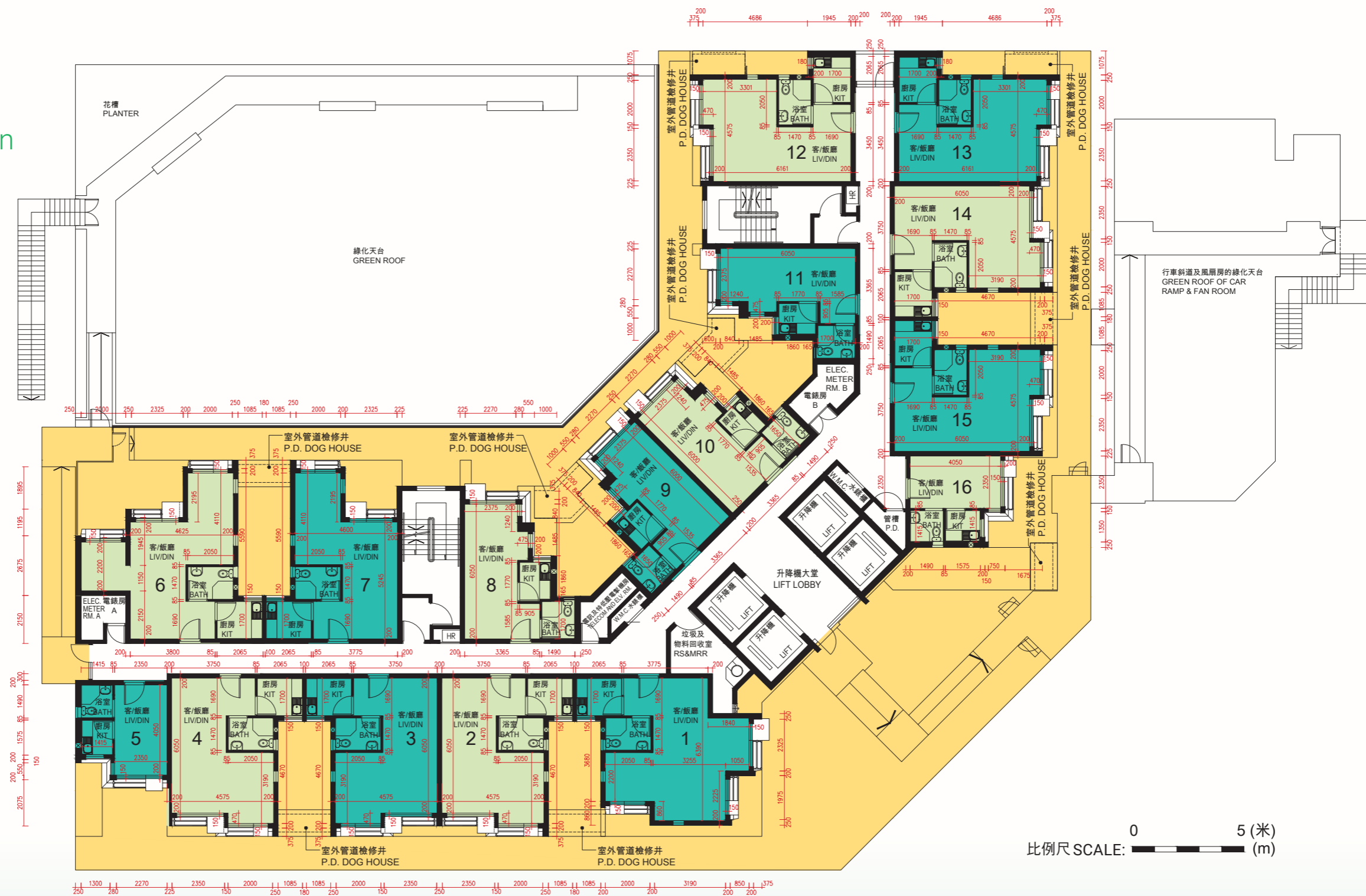
4 座1樓平面圖 Block 4 1/F Floor Plan