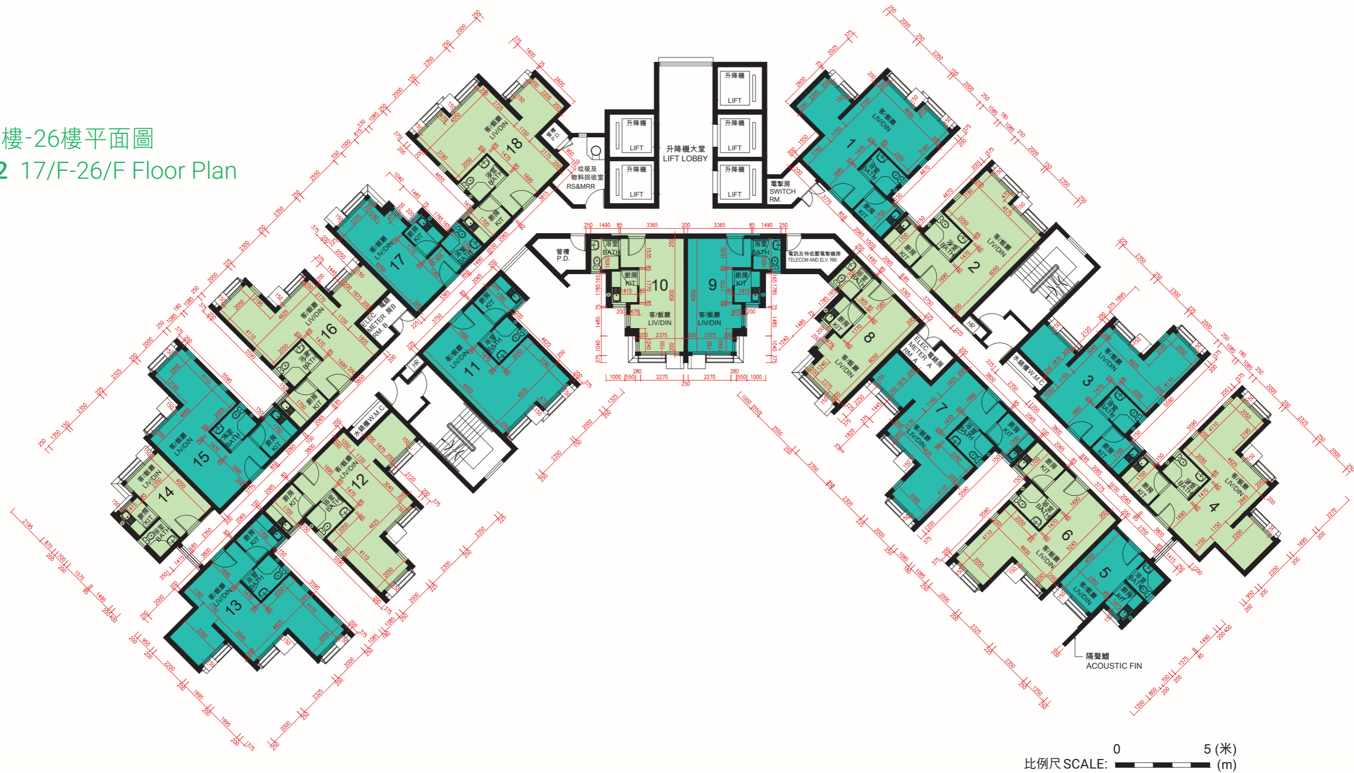
2座17樓-26樓平面圖 Block 2 17/F-26/F Floor Plan