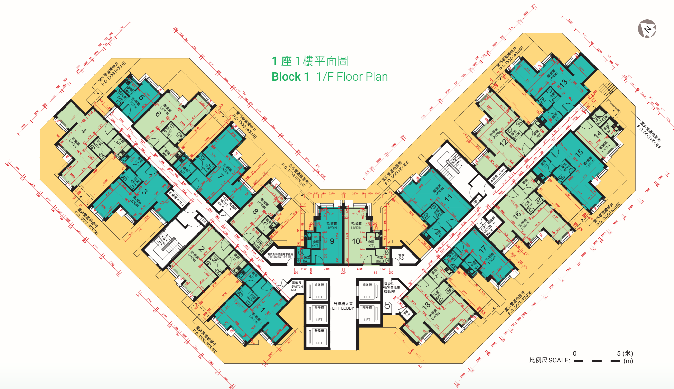
Block 1 1/F Floor Plan