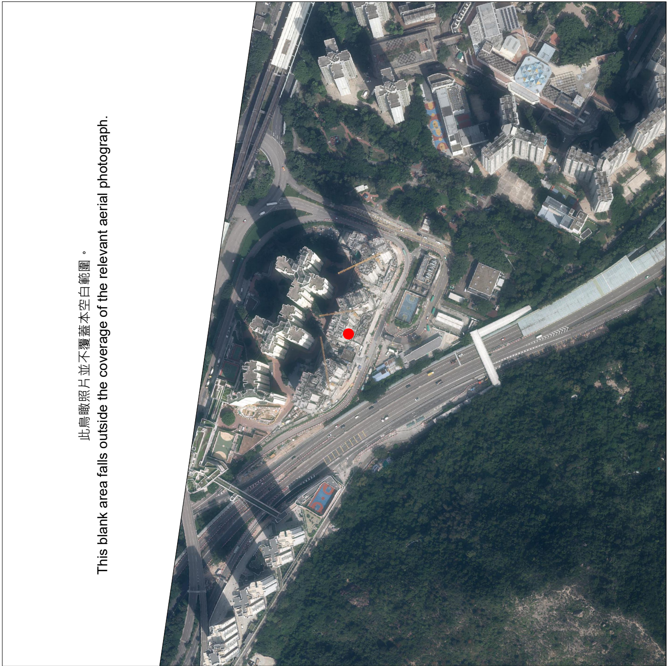
此鳥瞰照片並不覆蓋本空白範圍。 This blank area falls outside the coverage of the relevant aerial photograph.