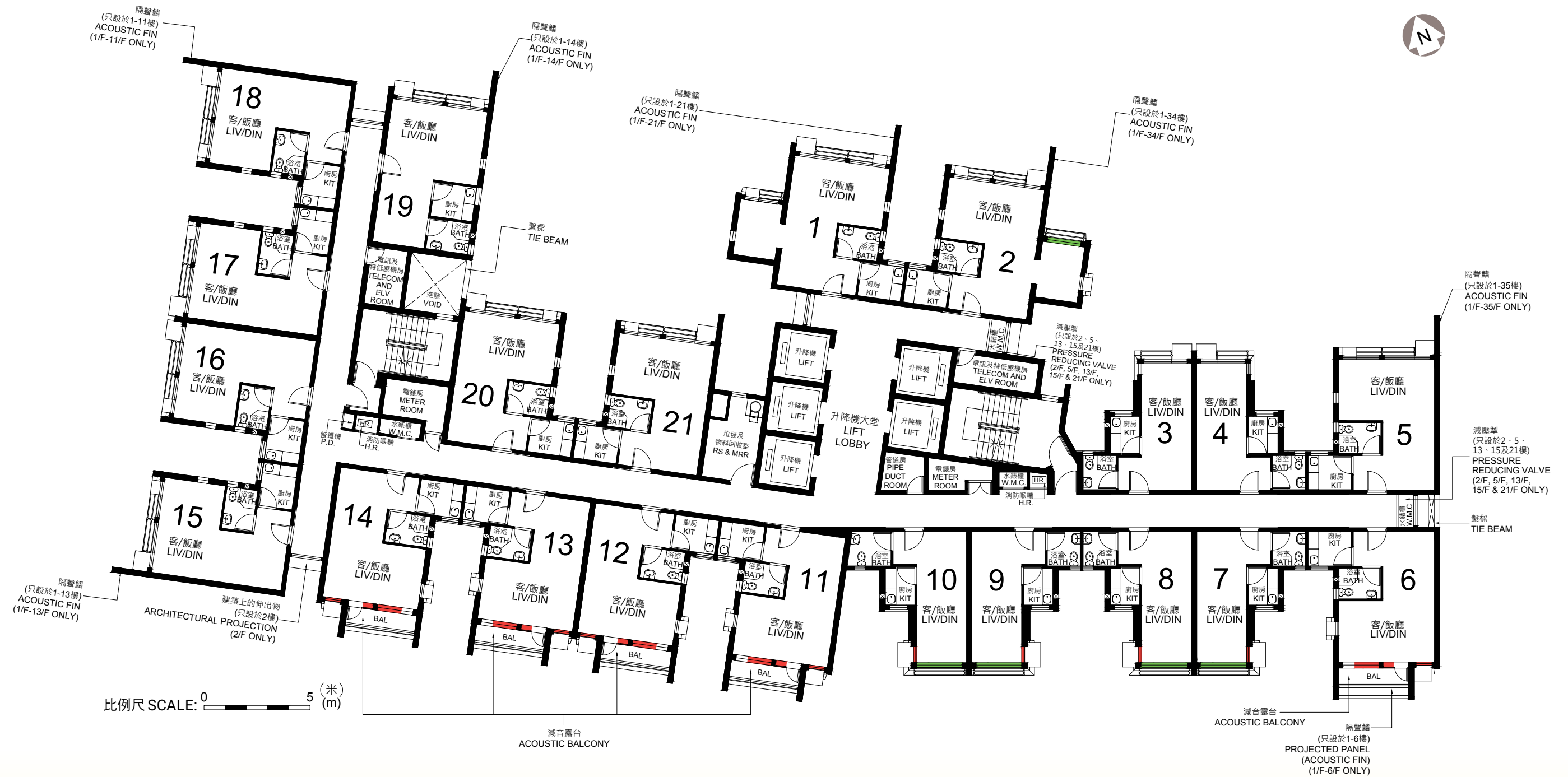
錦暉苑單位的減音露台、減音窗及固定窗的參考圖 Reference Plan for Acoustic Balconies, Acoustic Windows and Fixed Windows of Flats in Kam Fai Court