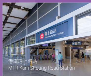
港鐵錦上路站 MTR Kam Sheung Road Station

毗鄰港鐵錦上路站，交通極為便捷，乘坐一站即達元朗站，少於半小時車程即可抵達尖東站，而到金鐘站僅約 32 分鐘（註 1） Close to MTR Kam Sheung Road Station, the location offers exceptional connectivity. It is just one stop to Yuen Long Station, under 30 minutes to East Tsim Sha Tsui Station, and approximately 32 minutes to Admiralty Station (Note 1)