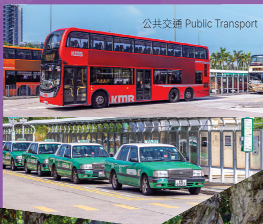
公共交通 Public Transport

Kam Sheung Road area will be connected to other major development areas within the Northern Metropolis and the Greater Bay Area through an extensive and efficient transport network