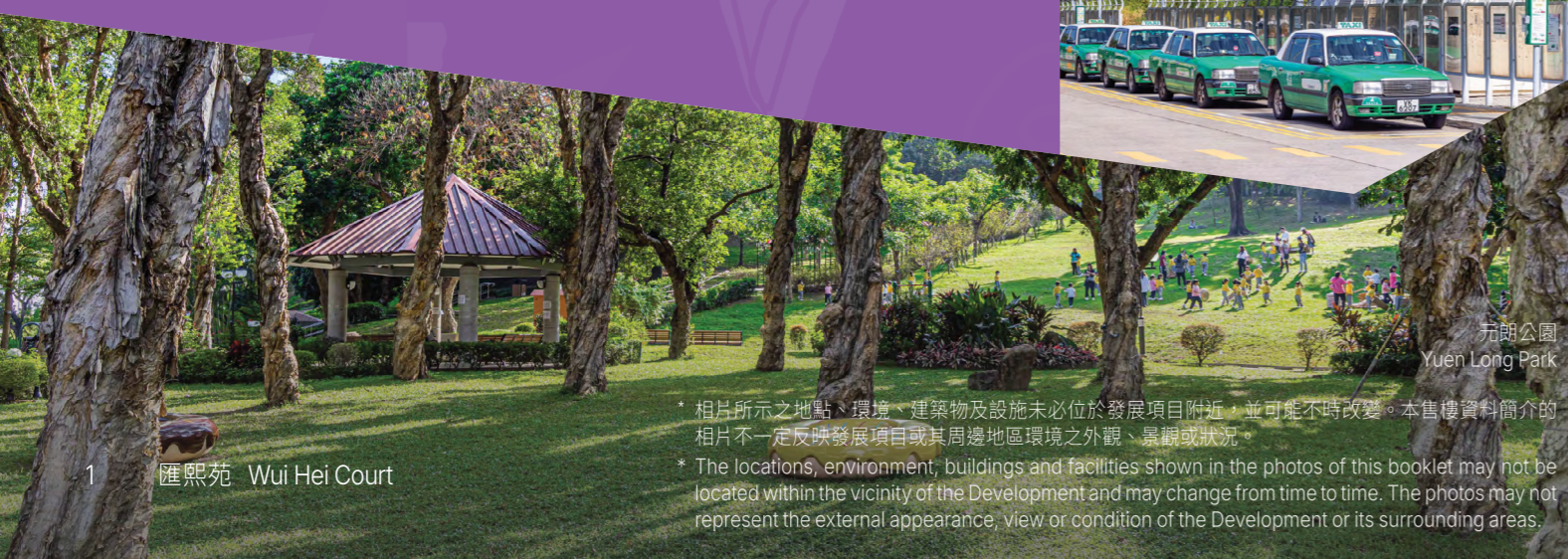
元朗公園 Yuen Long Park

* 相片所示之地點、環境、建築物及設施未必位於發展項目附近，並可能不時改變。本書樓資料簡介的相片不一定反映發展項目或其周邊地區環境之外觀、景觀或狀況。