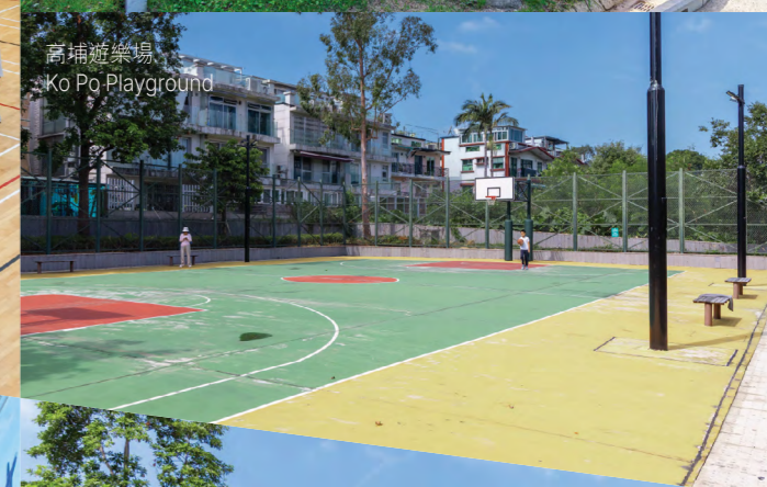
高埔遊樂場 Ko Po Playground