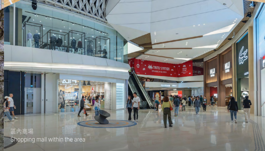
區內商場 Shopping mall within the area