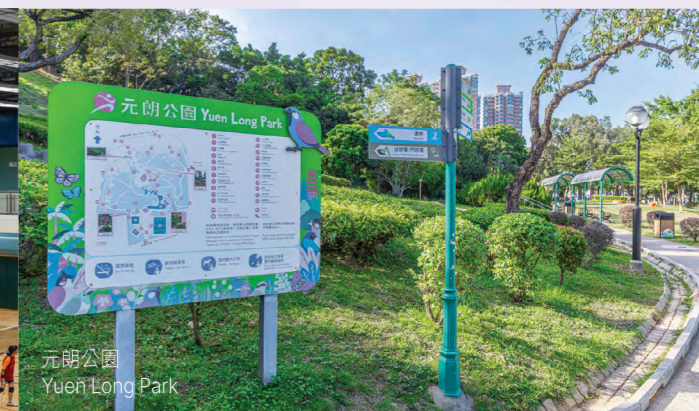
元朗公園 Yuen Long Park