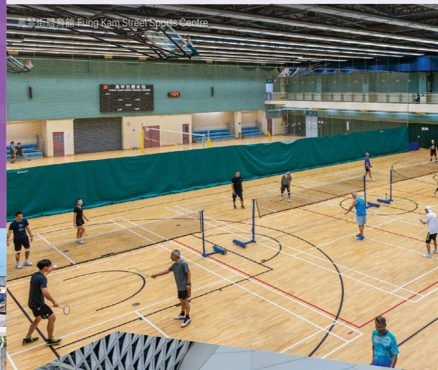
鳳琴街體育館 Fung Kam Street Sports Centre

屋苑鄰近一幅規劃作政府、機構或社區 (G/IC) 用途的土地，預計將興建一座多功能聯用大樓，支援生活所需（註 3） A joint-user complex is planned for the piece of land adjacent to the development, which is zoned for Government, Institution or Community (G/IC), supporting residents' daily convenience (Note 3)