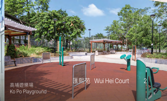
高埔遊樂場 Ko Po Playground