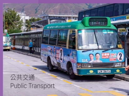
公共交通 Public Transport

錦上路一帶將透過完善的交通網絡，輕鬆連接北部都會區內的其他主要發展區域，並接軌大灣區