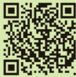
HOS 2025 website

For enquiries on application details of this sale exercise, please call HA Sales Hotline on 2712 8000 (handled by 1823), write to the HOS Sales Unit at Podium Level 1, Hong Kong Housing Authority Customer Service Centre, 3 Wang Tau Hom South Road, Kowloon / GSH Sales Unit at 1/F, Pioneer Place, 33 Hoi Yuen Road, Kwun Tong, Kowloon, or browse the website of HOS 2025 ( www.housingauthority.gov.hk/hos/2025 ) or GSH 2025 ( www.housingauthority.gov.hk/gsh/2025 ) or scan the QR code below and go to the relevant webpage to enquire about latest information.