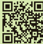
GSH 2025 website